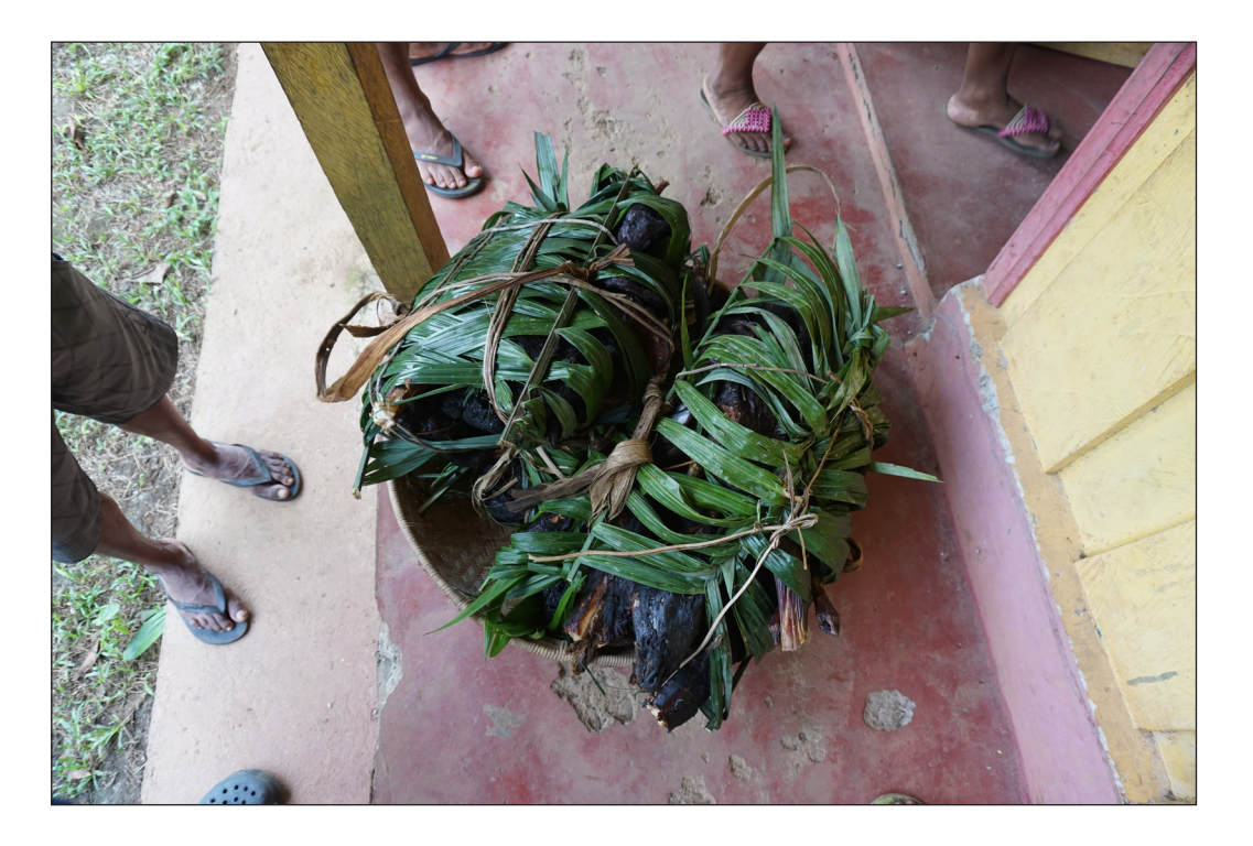
Figure 6 Smoked wild boar meat wrapped in açai palm leaf for Dabucuri offering.

Another motivation for Dâw mobility is the pan-regional dabucuri parties, which are celebrations involving offerings of food that has been harvested, hunted, or fished in abundance (see Figure 6). Dabucuris are traditionally accompanied by caxiri (fermented manioc beer) as well as dances, flutes, and body adornments; these events are also open to guests from neighboring Tukano and Arawak communities as well as other outside visitors. Dâw elders also speak of having participated in dabucuris hosted by their Tukanoan neighbors in the past, something which happens less frequently today. However, the dabucuris are still regarded by the Dâw as a significant event in which the entire community participates.