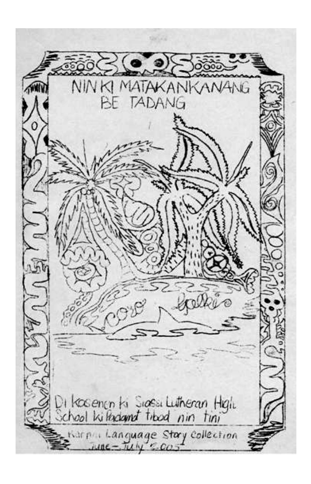
Image 4: Front cover of the Karnai story book Nin ki mata kankanang be tadang ('First time and fear stories')

The main products of the Karnai writers' workshop were superficially similar to those of the Arop workshop: a pamphlet-sized (A5) book of animal stories, Di usar ki tan be tek ('Animals of land and sea'), and a larger (A4, 13 pages) book containing students' individual stories (which were, perhaps not surprisingly, much shorter than the Arop stories).