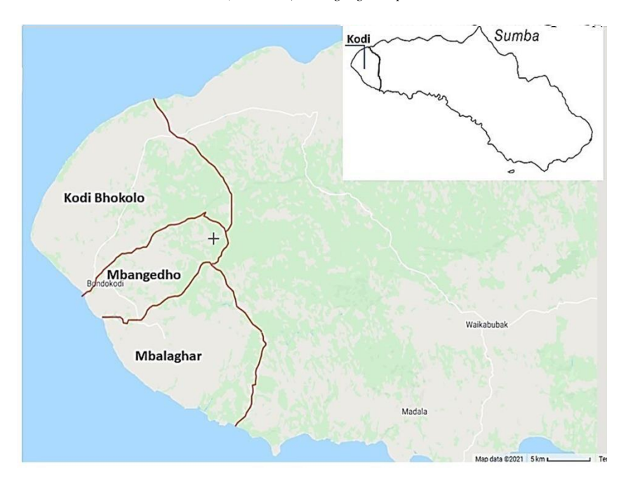
Figure 1. Kodi Bhokolo, Mbangedho, Mbalaghar locations<sup>3</sup>

Kodi society is primarily made up of subsistence farmers who use the land in three ways: 'as garden (mango), as fallow plots (ramma), and as pastures for livestock (marada)' (Hoskin 1993: 6). To meet their daily food needs, Kodi people plant rice and corn in their mango, which is mixed with beans, tubers, chillies, and vegetables. Nowadays to fulfil secondary needs (e.g., education), they mostly cultivate cashew trees for their profitable and abundant nuts. In addition to supplying their food source, farming also fulfils a crucial social function of being a prestige component of the economy (Hoskin 1993). In this sense, the prestige economy relates to the social and economic currency of raising herds of buffalo, horses, and cattle in Kodi society. Other common livestock includes chickens and pigs. This livestock is also raised for sacrifice in Marapu ritualised events such as paholong, woleka 'ceremony feast', and