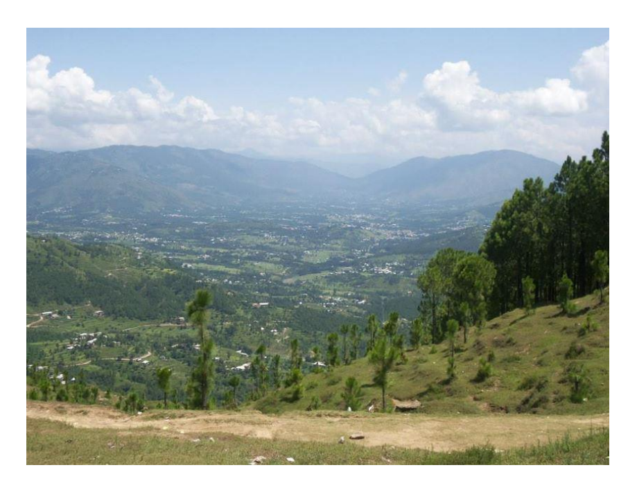
Figure 3. An overview of the Mankiyali-speaking area in Mansehra, Khyber Pakhtunkhwa, Pakistan.