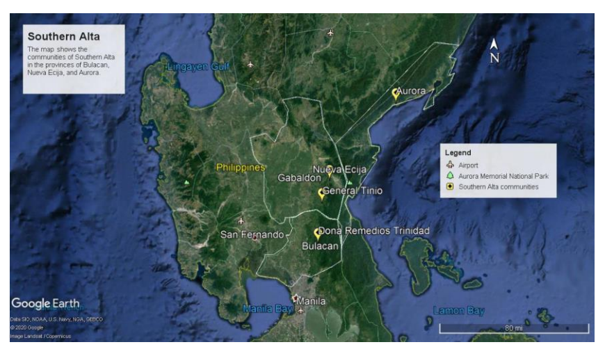
Figure 2: Southern Alta communities in the provinces of Bulacan, Nueva Ecija and Aurora. Full-scale version of this map on page 25.

Kabuluwan, Kabulowen, or Kabuloan are alternative names, however Ita , <sup>4</sup> which has appeared in other literature, is not. Non-Negrito groups call them Dumagat, or the derogatory terms Baluga or Kabalat . <sup>5</sup> Kabulowans call non-Negrito peoples Taw or Mommalayan .