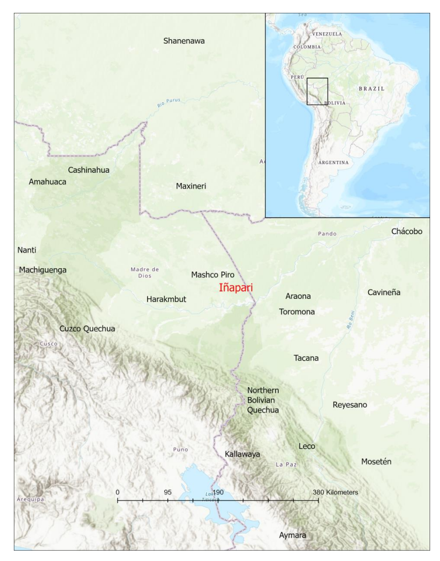
Figure 1: Geographical Location of Iñapari