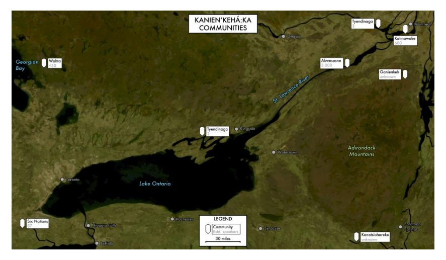
Figure 1: A map of Kanien'kehá:ka communities. © 2020 Joseph Pentangelo. Some materials provided by U.S. Geological Survey, National Geospatial Program. Full-scale version of this map on page 8.

<sup>1</sup> Variant spellings of some of these names are widespread and the choice of one spelling over another can be contentious. I have adopted spellings that seem to be the most widely used. In the past, Kanesatake was more often referred to as Oka, Wahta was called Gibson, and Kahnawake was often spelled Caughnawaga. Akwesasne is sometimes referred to as St. Regis, especially in historic materials, and the St. Regis Mohawk Tribe represents the portion of Akwesasne in the United States. A referendum on renaming this to the 'Akwesasne Mohawk Tribe' was scheduled for 2020, but postponed due to the COVID-19 pandemic https://bit.ly/316vxOH (accessed 2020-09-29)