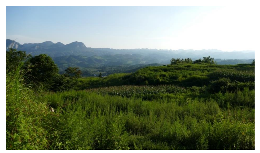
Figure 5: Landscape in Jinsha county