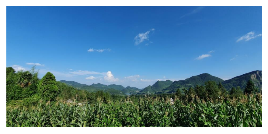
Figure 6: Landscape and corn field in Jinsha county

1980s, a part of the Datou and Madeng Longjia is said to have also spoken a form of broken Yi (GMSWSB 1982: 5). In both cases, 'Yi' probably refers to, in Chen's (2010: 32) terminology, the Nipu 尼普 subdialect of the Nasu 纳苏 dialect. Today, Southwestern Mandarin and Standard Mandarin are the dominant languages of the area, leading to widespread bilingualism and subsequently the replacement of many local languages, including Caijia, Longjia, and Luren.