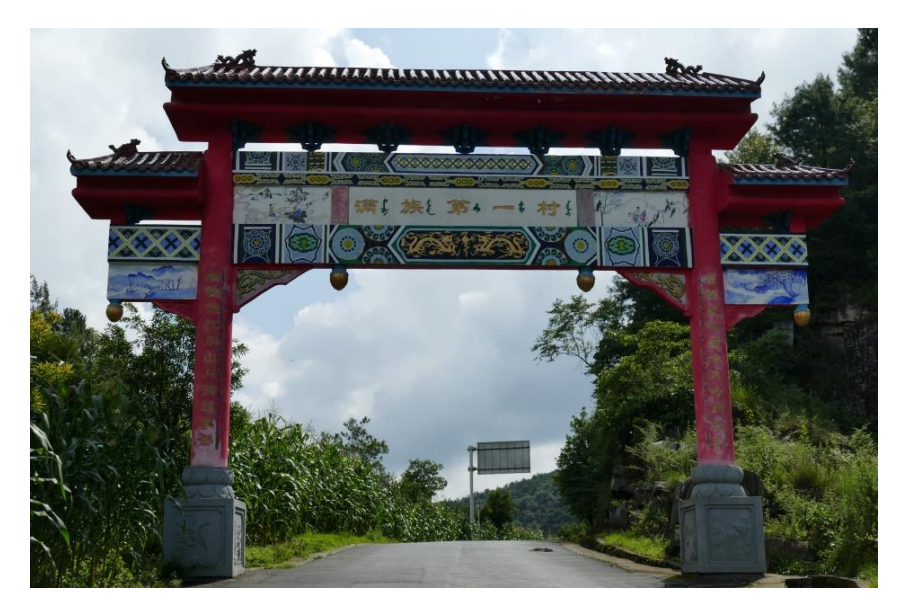
Figure 10: The entrance gate to Fuyuan, 'the first Manchu village' (manzu diyi cun 满族第一村 in Chinese, manju uksura i uju tokso in Manchu), Qianxi

Longjia seems to have vanished during the 1980s. Fieldwork could still produce important information, but in the absence of fluent speakers, the amount of available data will probably not rise considerably. Most likely, further linguistic evidence will be restricted to toponyms or personal names in genealogies and on tombstones. It is, therefore, all the more important to make use of the hitherto unknown field notes that are currently being prepared for publication. With Luren being extinct and even less well documented than Longjia, the only possibility to gather more information on the 'Ta-Li' (or 'Cai-Long') languages is fieldwork among the remaining speech communities of Caijia.