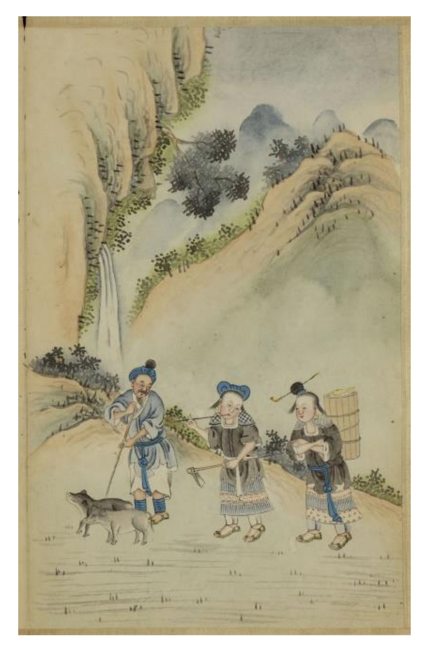
Figure 3: The Hei Longjia in a Miao album at Kyōto University (JMT)