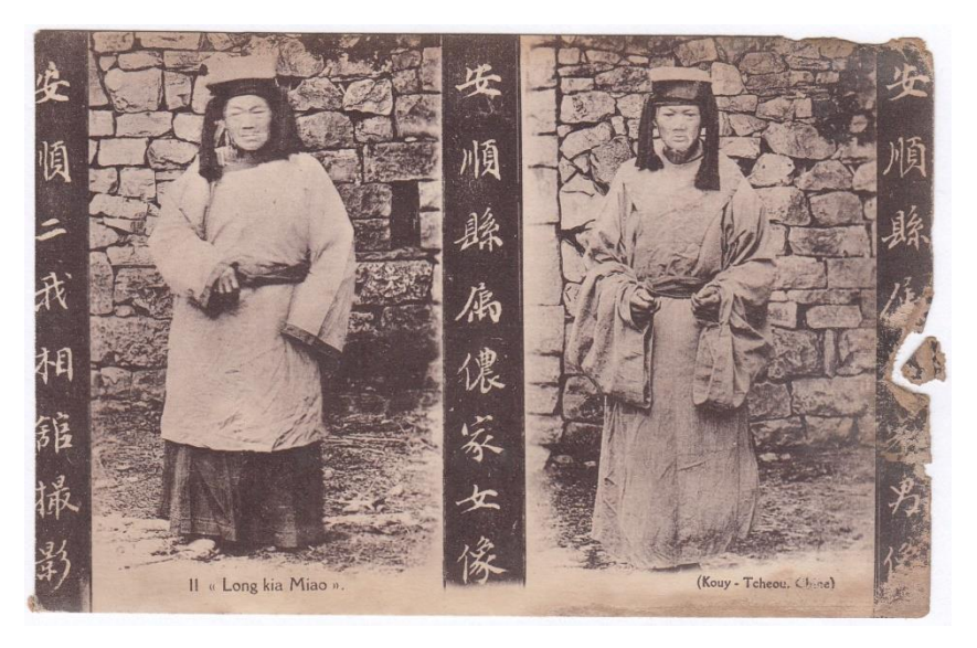
Figure 1: Postcard of a 'Long kia Miao' woman (left) and man from Anshun, early 20th century