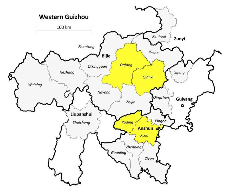
Figure 4: Location of the Longjia in Western Guizhou <sup>5</sup>

In Figure 4, all areas in Guizhou where the Longjia were located according to the traditional and modern sources mentioned above are indicated in grey. Longjia data were recorded in areas marked yellow (see Section 7). Luren data have been collected in Qianxi and Jinsha (Hölzl 2021), Caijia data in Weining (e.g., Hsiu 2018), Hezhang (e.g., Lü 2020), and Shuicheng (LPSZ 2003: 184f.).