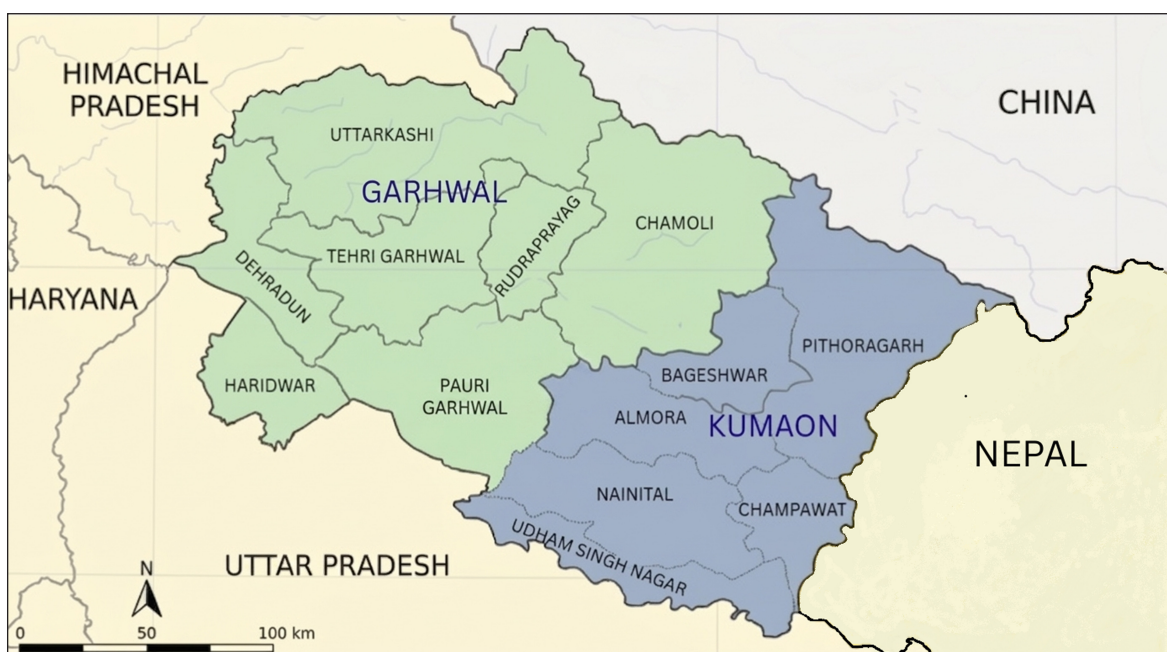
Figure 1: Map of Uttarakhand (Kumaon division highlighted in blue).

The Union Province that later became Uttar Pradesh included Kumaon before Indian independence. In 2000, the newly established state was granted the name Uttarakhand ( uttar ‘north,’ anchal ‘zone’) since it had a less separatist connotation than the planned name Uttarakhand ( uttar ‘north,’ khand ‘segment’).